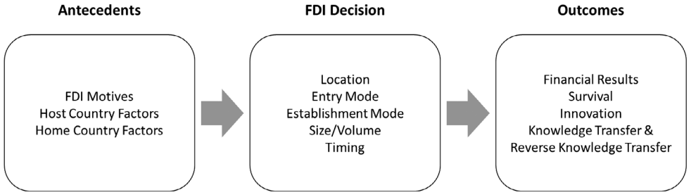
Figure 1. Conceptual framework – antecedents, decisions and outcomes (ADO).