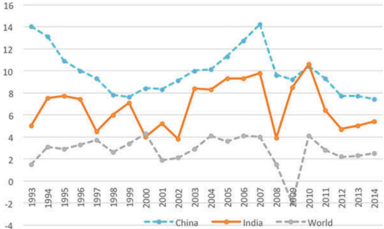
Figure 1. Average real GDP growth rate in China, India, and the world (percentage), from 1993–2014.

Similarly, China has emerged as a major player in critical technologies (Zhou and Leydesdorff 2006). Heilmann (2008) examined the role of policy experimentation in China's economic rise within the context of distinctive tools, processes, and effects of policy-related programs of its economic reform. He found that China's experience attests to the potency of experimentation in bringing a transformative change, even in a rigid authoritarian, bureaucratic environment. Some experts note that, in China—"the fastest growing Asian economy"—there is an urgency to train larger numbers of leaders because the demand for talent has outstripped available indigenous human capital resources for several years (Shyamsunder et al. 2011; Van Velsor et al. 2013).